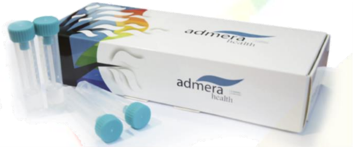
Figure 1: FloraPrep™ Collection & Preservation Kit