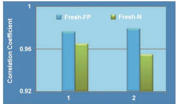
Figure 4: Comparison of FloraPrep™ with commercially available products (correlation coefficients shown)